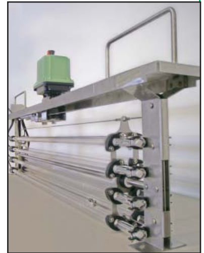
UltraDynamics® Series 8200 Open Channel Horizontal & Vertical Wastewater Ultraviolet Disinfection Systems