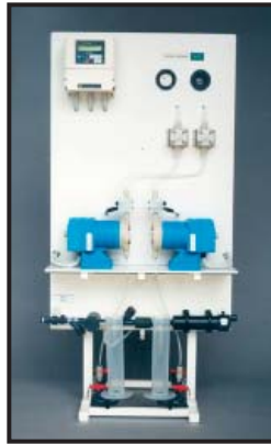
Capital Controls® Models T70G4000 & T70GD4000 Chlorine Dioxide Generators