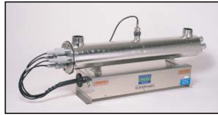
UltraDynamics® Series 8102 Industrial/Commercial Ultraviolet Disinfection Systems Ranging from 2 - 3,000 GPM (7.6 - 11,356 l/m)