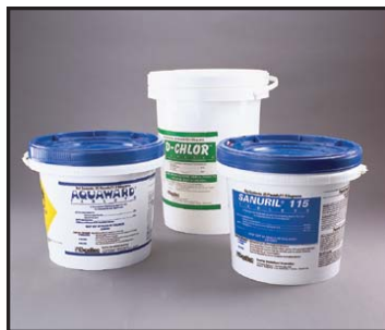
Aquaward® Sanuril® D-Chlor™ - Erosion Tablet Feeders and Tablets