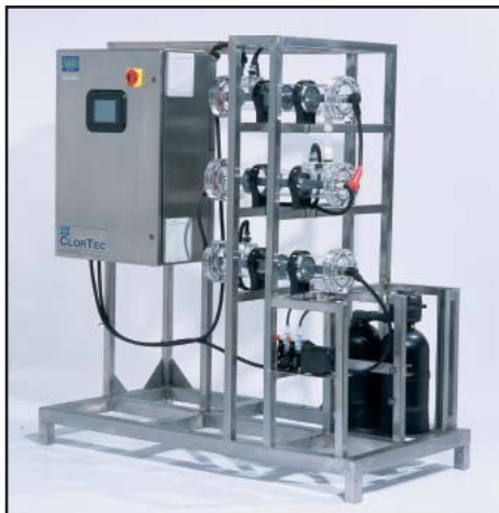
ClorTec® Component and Skid Mounted Systems 6 - 300 lb/day