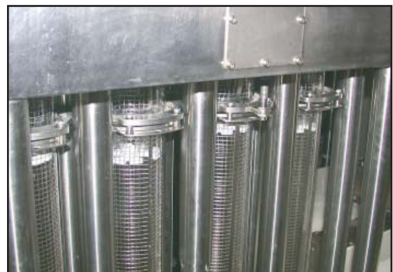
The MicroDynamics® automatic wiper system is chemical-free and uses a motor driven stainless steel assembly.