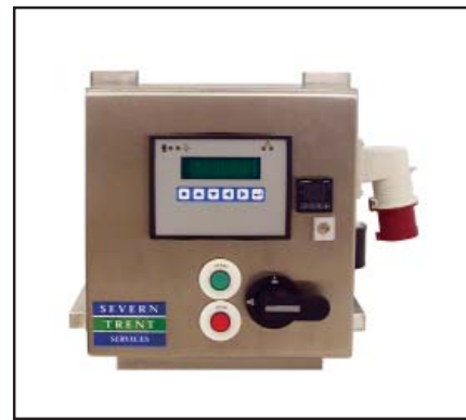
The power control center monitors and controls all operational functions, including MicroPace™ technology.