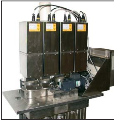
No electrical contacts means that lamps can be removed from above the water line.

MicroDynamics UV disinfection is a proven, cost-effective, reliable and safe disinfection treatment method.